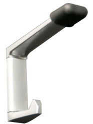
Concealed fix coat hooks