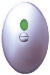
Indicator face plate