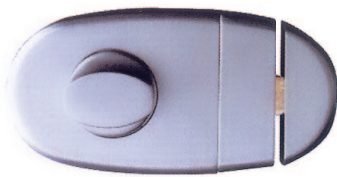
Superior lock with integrated bumper and concealed fix