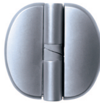
Concealed fix gravity hinges